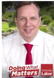
Matt Fregon MP Ashwood