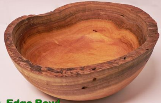
Nat. Edge Bowl D 31cm H13cm, Wall 2cm