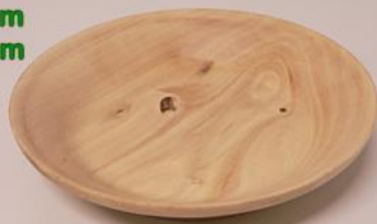
Silver Birch Custom Friction Polish