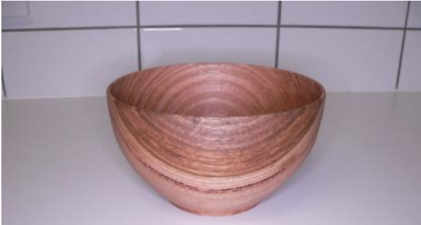
Tim Chen, small Bowl D 16cm, H 9.5cm Eucalypt Walnut Oil