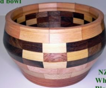
NZ-Beech White Oak Blackwood King Billy Pine Livos Oil