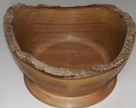
Russell Painter nat. edge Bowl Silver Birch D 15cm H 8.5cm