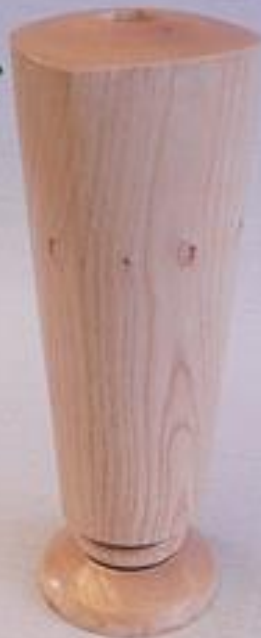
Desert Ash, Wipe on Poly D 8cm, H 19cm,