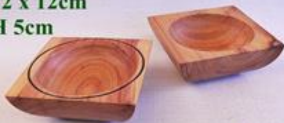
Cyprus Wipe on Poly