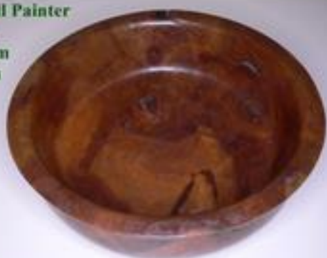
Moorpark Apricot, French Polish