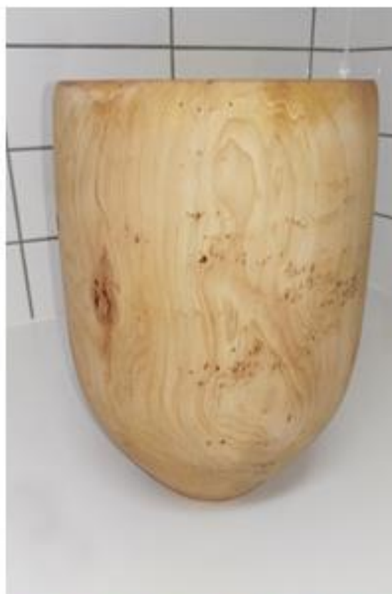
Tim Chen, Vase, D 18cm, H 27cm Golden Cypress int. - Livos Oil, ext. - Spray Laquer