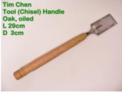
Tim Chen Tool (Chisel) Handle Oak, oiled L 29cm D 3cm