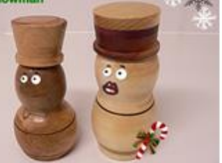
H 16cm / 18cm