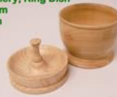
Claret Ash Shellawax