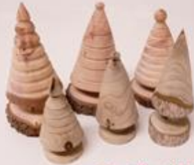
She - Oak H 11 - 16cm