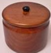
Red Gum / Blackwood / Ebony Livios Oil