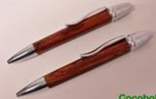
Cocobolo Spray Laquer