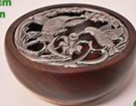
Gidgee Abrasive Paste