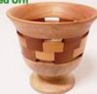
London Plane / Fig / Surian Fiji Mahogany / Red Cedar Spray Laquer