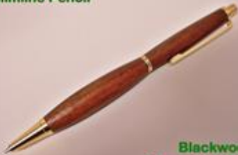
Blackwood Carnauba Wax