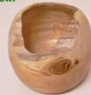
Callitris Native Pine Wipe - on Poly