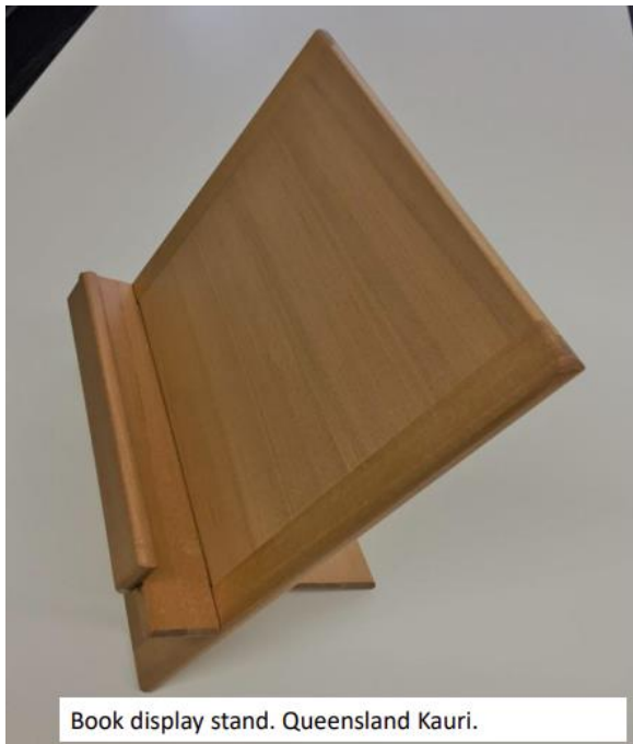
Book display stand. Queensland Kauri.