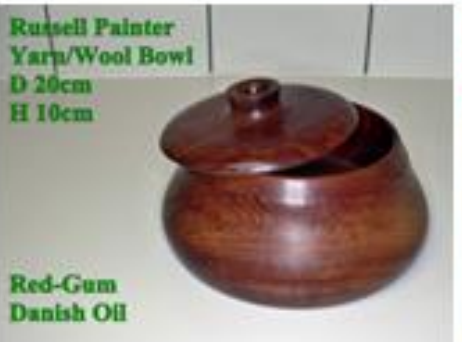
Russell Painter Yarp/Wool Bowl D 20cm H 10cm