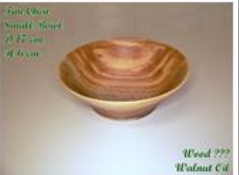
Ian Chen Small Bowl D 17 cm H 6cm