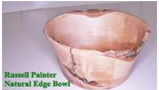
Russell Painter Natural Edge Bowl D 14cm H 7cm Silver Birch, No Finish