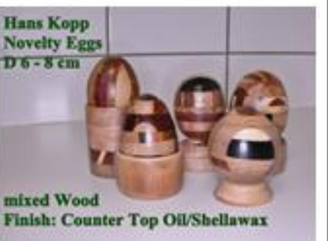
Hans Kopp Novelty Eggs D 6 - 8 cm