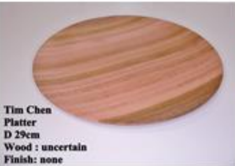
Tim Chen Platter D 29cm Wood : uncertain Finish: none