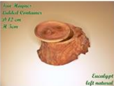
Ian Haynes Lidded Container D 12 cm H 3cm