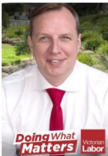
Matt Fregon MP Ashwood