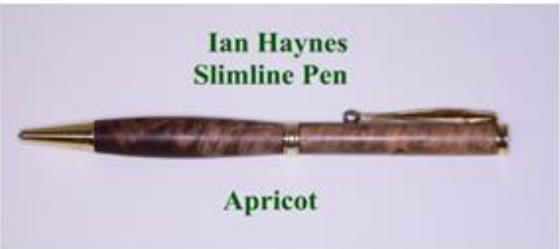
Ian Haynes Slimline Pen