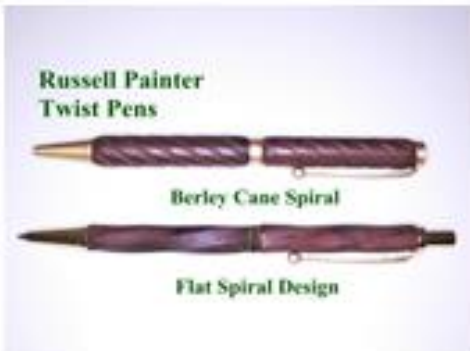
Russell Painter Twist Pens