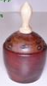
Olive / Bankia / Red Gum Spray on Laquer