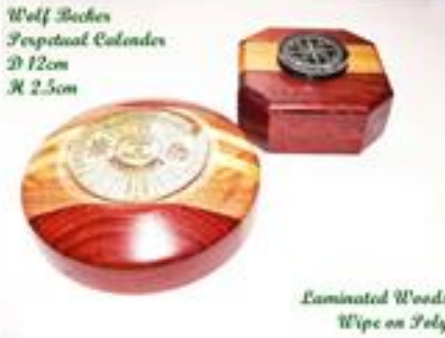
Wolf Becker Festivaal Calendar D 12cm H 2.5cm